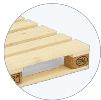
Wooden, plastic and metal pallets