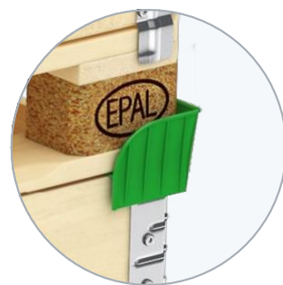
Plastic corners for multilevel storage