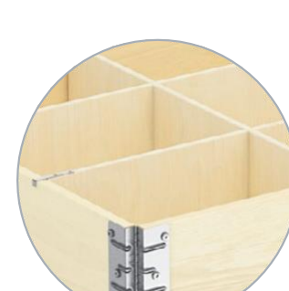
Dividers for 4, 9 or 12 sections