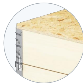
Wooden and plastic lids