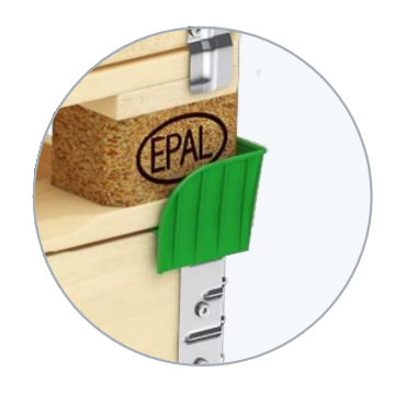
Plastic corners for multilevel storage