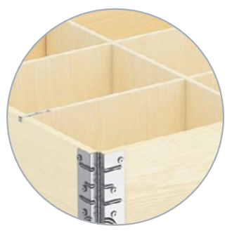
Dividers for 4, 9 or 12 sections