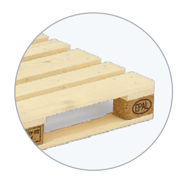
Wooden, plastic and metal pallets