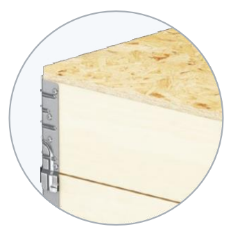
Wooden and plastic lids