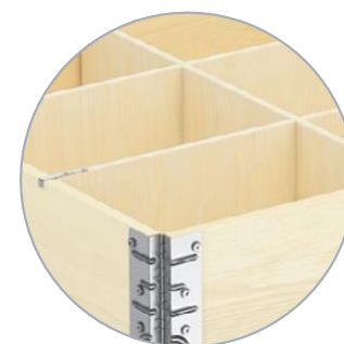
Dividers for 4, 9 or 12 sections