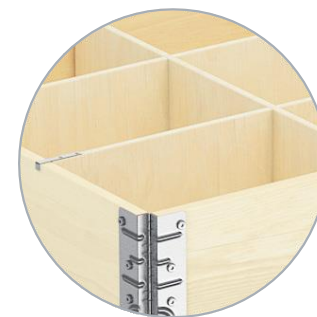
Dividers for 4, 9 or 12 sections