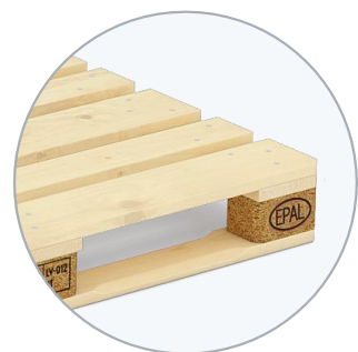
Wooden, plastic and metal pallets